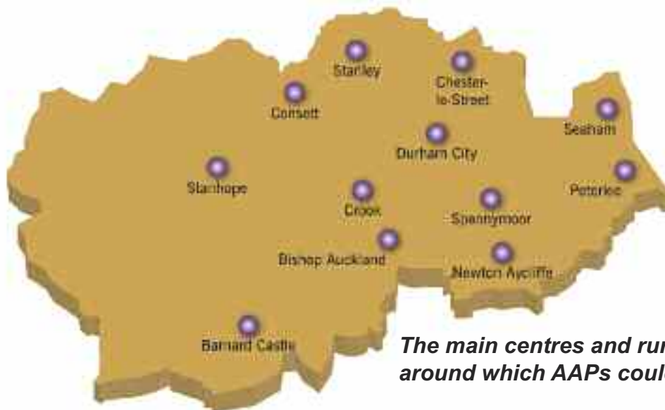
The main centres and rural areas around which AAPs could be based

Area Action Partnerships would be an integral part of the unitary council providing a link between the council and local neighbourhoods in the county. They would be local decision-making and consultation partnerships, listening to the views of local communities, and acting on what local people say.